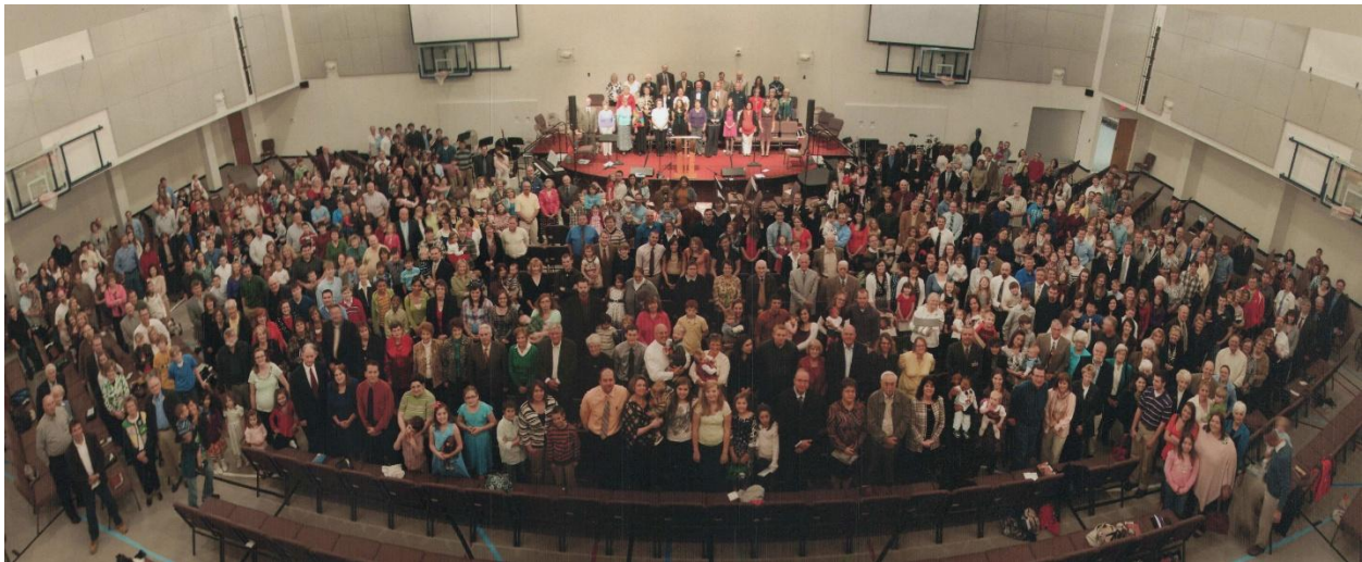
The GraceLife Family Hebrews 2:6-13