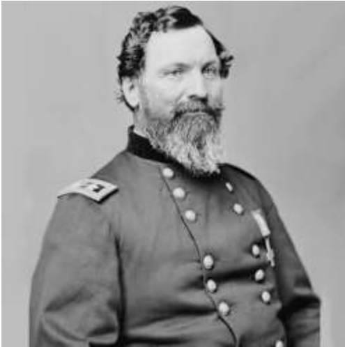
General John Sedgwick