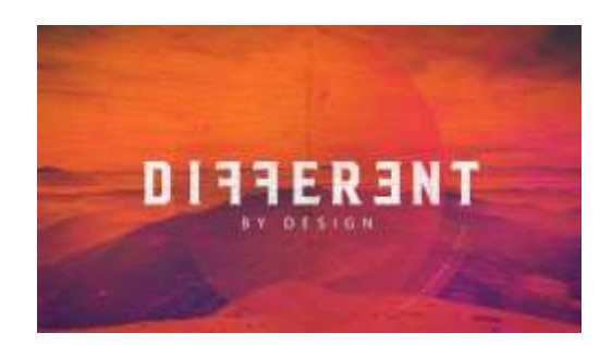
Doing Right and Being Wronged 1 Peter 3:13-17